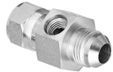
Tee Test Point Fitting 6564-08-08-04

It's recommended you obtain a Tee Test Point Fitting - # 6564-FG (6564-08-08-04) 3/4"-16 Male JIC x 3/4"-16 Female JIC Swivel x 7/16"-20 Female O-Ring Boss.